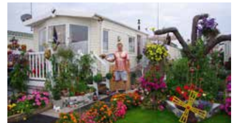
3rd Place - Mr Clarke - CG059 (£1,000 site fee credit)